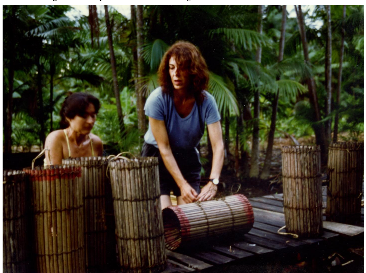
Figure 1. Matopiba: research in Tabatinga, Pará, Brazil with ribeirinhos, 1996.