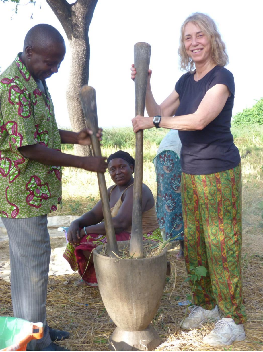
Figure 4. P1040782: mangrove rice system, The Gambia, 2015.