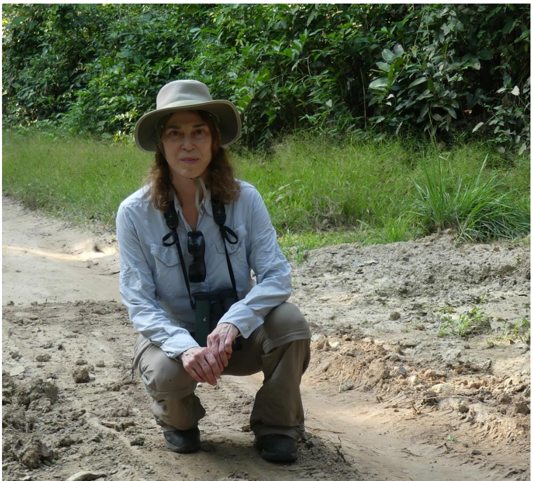
Figure 5. P1000835: research Central African Republic, 2018.

As brought together from multiple fields of investigation, such diverse evidentiary approaches indicate that even as involuntary migrants to the Americas, enslaved Africans also were protagonists in the introduction and establishment of Old World tropical food crops in plantation societies.